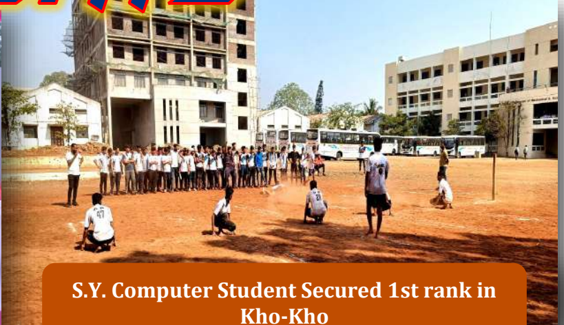
S.Y. Computer Student Secured 1st rank in Kho-Kho