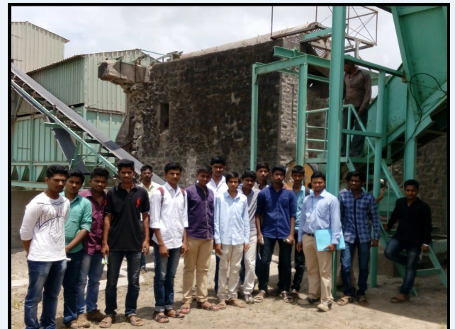
Visit to Stone Crusher