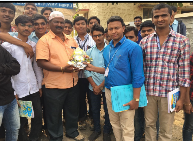
Visit to Railway Station, Miraj Junction.